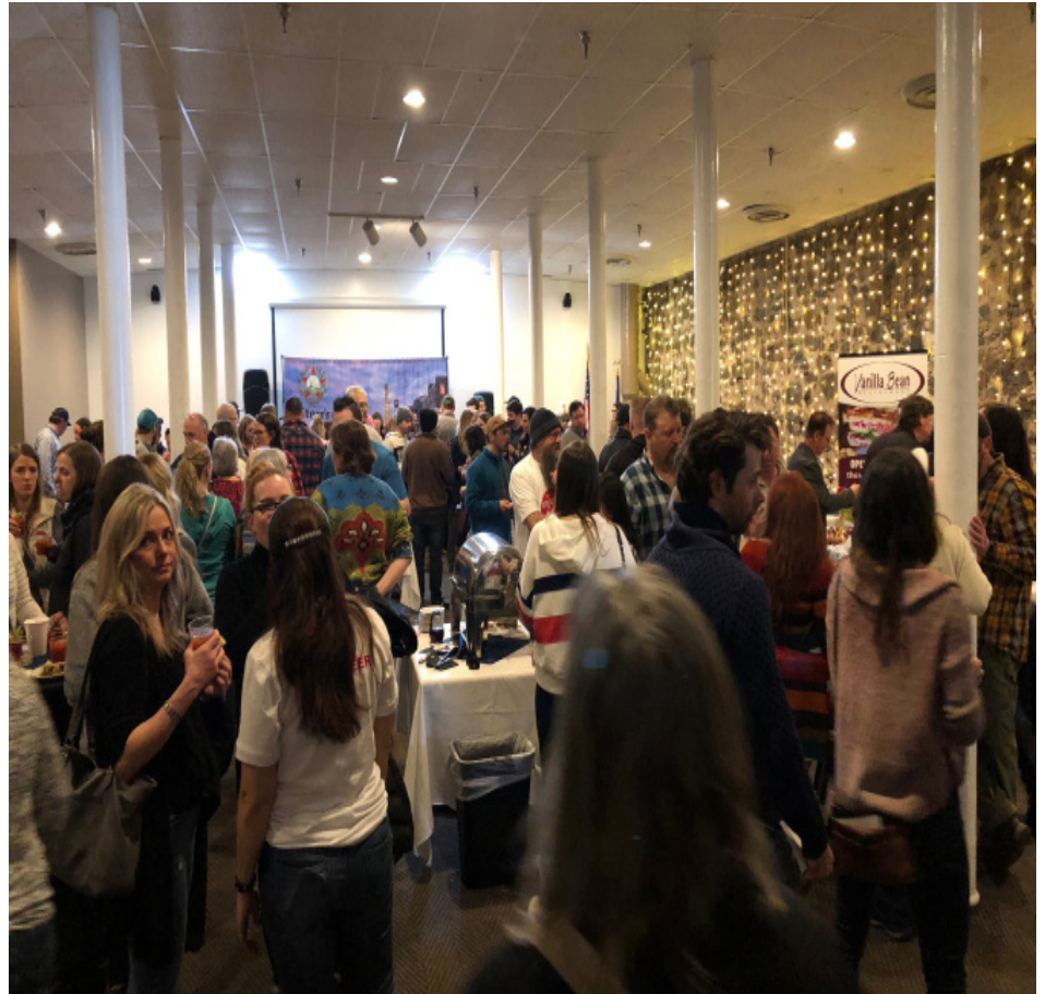
Life House Twin Ports Bloody Mary Battle and Brunch