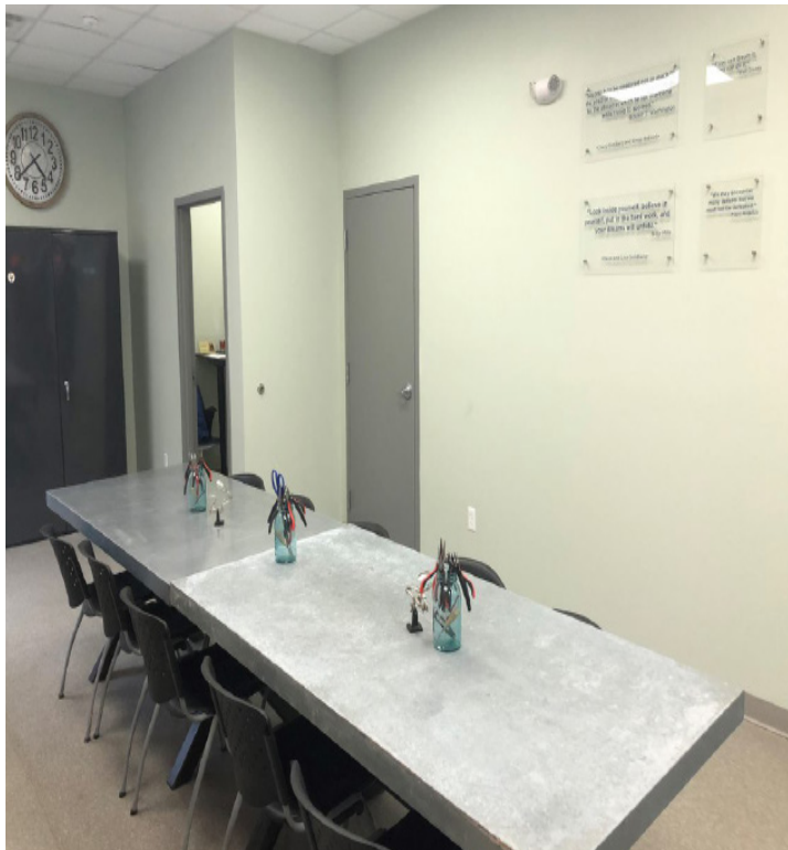
Annex open concept workshop area

Life House was the recipient of the Maurices Grand Give volunteer event. During the project about 30 volunteers spent the day creating a micro version of a Maurices boutique, which we affectionately named Maurices Market.