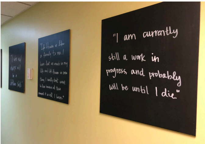
Life House Mental Health and Wellness Wall