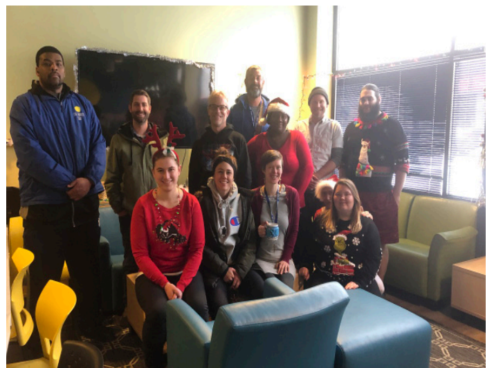
Life House staff are ready for the Annual Holiday Party. With generous supporters, we have been able to distribute gifts to more than 100 youth and young families.