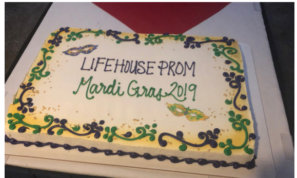
About 75 youth come together to celebrate Prom, and the theme for the year was Mardi Gras.