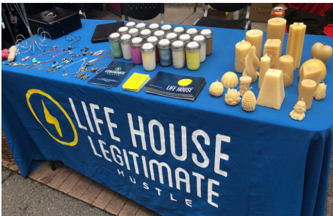
The Legitimate Hustle Program sold candles throughout many community events, which included Duluth Sidewalk Days.