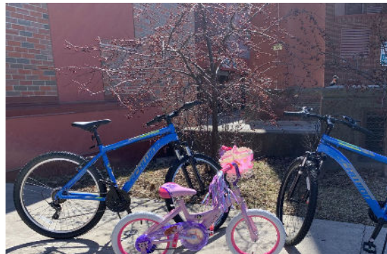
(Below) The Pulkrabek Foundation donated funds to purchase bikes for youth.

LIFE HOUSE PROVIDES EQUAL EMPLOYMENT OPPORTUNITY TO ALL QUALIFIED INDIVIDUALS WITHOUT REGARD TO RACE, CREED, COLOR, NATIONAL ORIGIN, ANCESTRY, RELIGIOUS BELIEF, SEX, GENDER IDENTITY OR EXPRESSION, AGE, PHYSICAL OR MENTAL DISABILITY, VETERAN STATUS OR OTHER PROTECTED CLASSIFICATION. LIFE HOUSE ENCOURAGES INDIVIDUALS WITH DIVERSE BACKGROUNDS AND MEMBERS OF THE LGBTQ COMMUNITY TO APPLY.